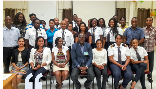
This photo was taken before the COVID19 pandemic.

We had started the year [2019] with about an average of six days clearance time and as of December we had gone down to three days.