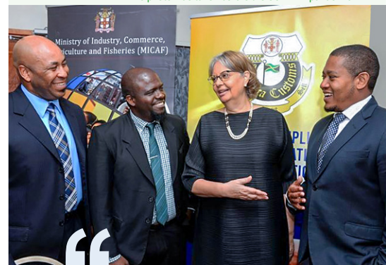
This photo was taken before the COVID19 pandemic.

Based on the high level of same-day processing [by Trade Board Limited] that we are seeing, they must be commended for their efforts. This is an outstanding achievement and an improvement on the original target.