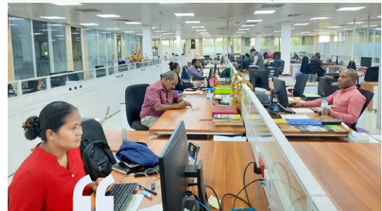
Customs Officers in Papua New Guinea

The implementation of SMP has allowed for an expedited process, minimal use of paper, better systematic audit trail of transfers and cargos, enhanced tracking and monitoring of goods move and increased confidence of shipping and terminal operators.