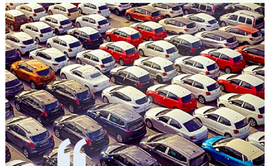
Tuvalu customs office.

In 2019, the average processing time [...] per customs declaration was 23.7 hours. This has been reduced by 52% and currently stands at 11.2 hours per declaration in 2021.